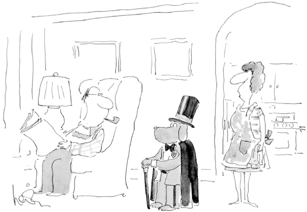
© The New Yorker Collection 1983 Arnie Levin from cartoonbank.com. All Rights Reserved.

"Howard, I think the dog wants to go out."